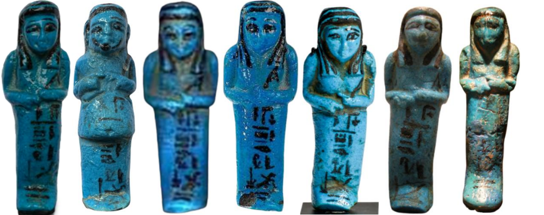
Memphis Memphis A B C D E