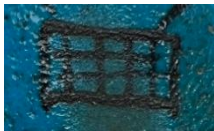
Rectangular, detailed (Coll. Memphis, NH-145)

A seed basket is carried on the back, differently executed, whereby the detailed rectangular is the most common.