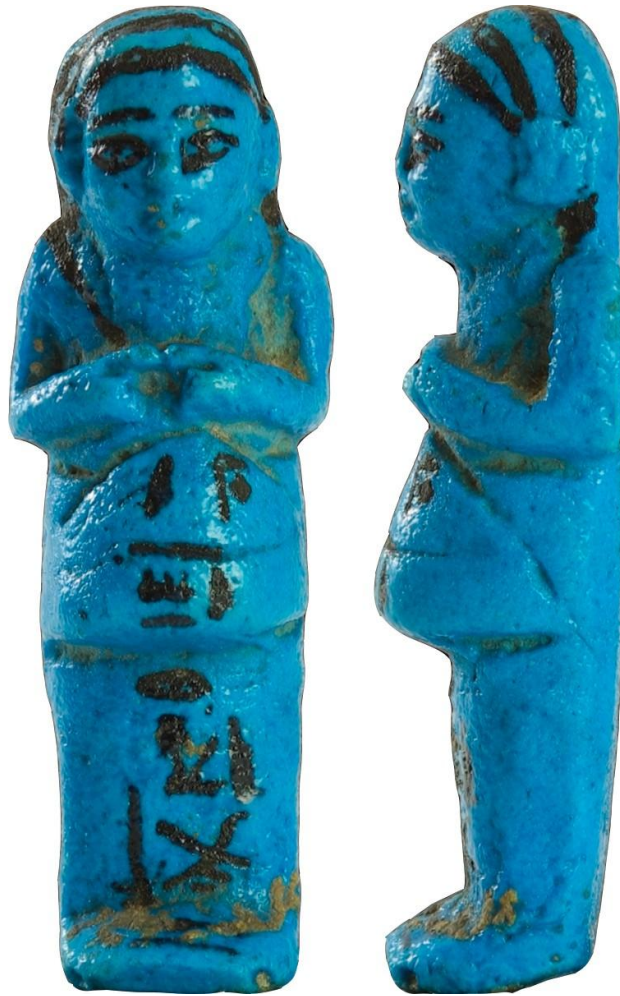
© Shabtis – A Private View, Glenn Janes

Published: Shabtis – A Private View , Glenn Janes, nr. 39 page 81 and 82.