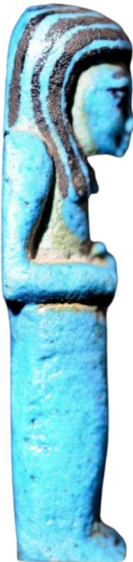
Peculiar striated wig and uniquely executed arm (Coll. Aquaorama)

The overseers are carrying a whip, some in the left hand to the right shoulder others in the right hand to the left shoulder or two on both shoulders. The arms on both worker types and overseer types are well modelled which is unusual and the hands are executed left above right. The hands of the overseer type are opposed with very long thumbs. Both the worker types and overseer types all feature a tripartite striated painted wig which is notably pronounced from the forehead. Some of the overseers feature another unique shabti feature: a painted beard.