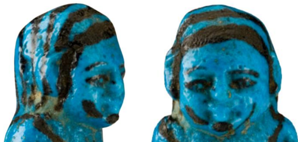
Unique painted beard (?) (Raleigh)

The worker types vary in size between 9.5 CM and 10.5 CM. The overseer types measure around 10.2 CM.