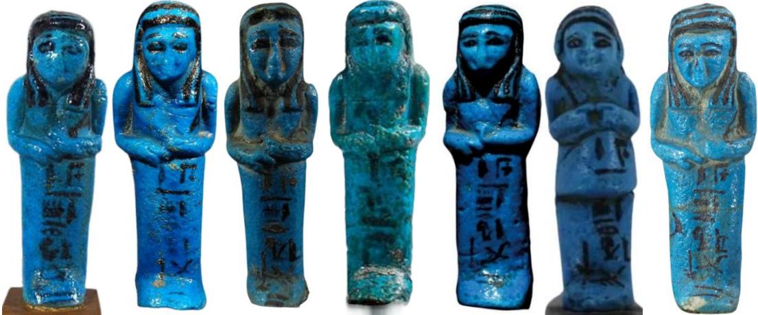
F G H I J K L