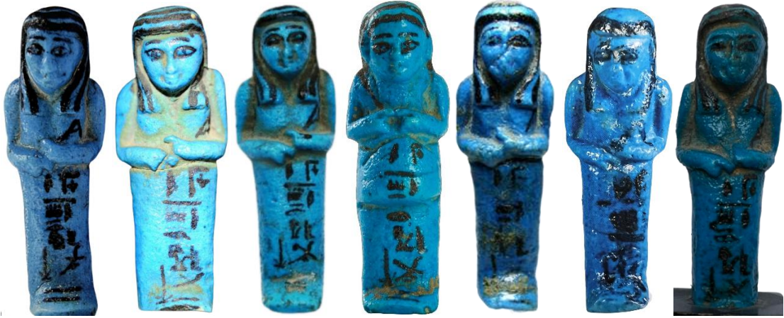
Amasis Arqueorama HP Kemehu MB MB Memphis